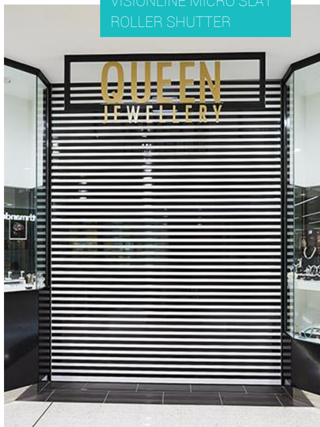
VISIONLINE MICRO SLAT ROLLER SHUTTER