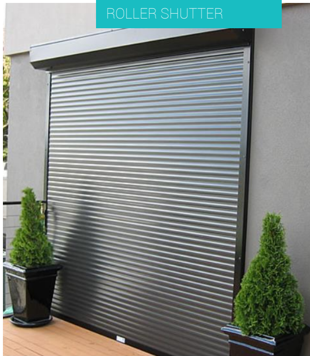
VISIONLINE MICRO SLAT ROLLER SHUTTER